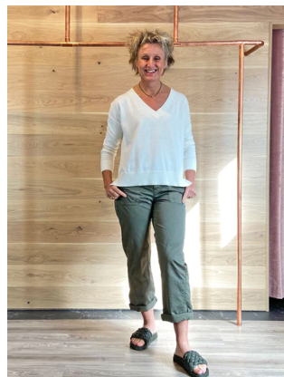
Absolut Cashmere Serena Knit Ecru £94.95