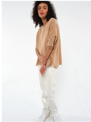
Absolut Cashmere Olympe Knit Camel £159.95

Berties Clothing 28 Guildhall Road Northampton NN1 1EW T. 01604 602101