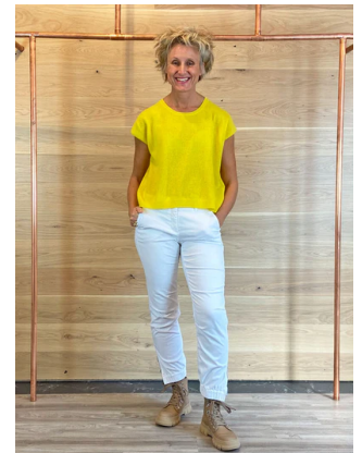
Absolut Cashmere Louise Short Sleeve Knit Citron £143.00