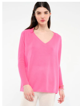
Absolut Cashmere Camille Knit Pink £182.00