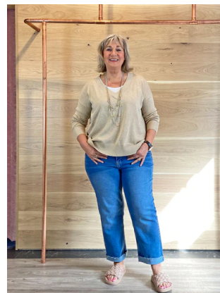
Absolut Cashmere Serena Knit Beige £94.95