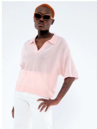
Absolut Cashmere Charlene Short Sleeve Knit Blush £182.00