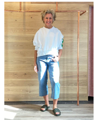
Absolut Cashmere Coralie Sweatshirt White £70.00