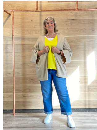
Absolut Cashmere Gaelle Cardigan Beige £159.95