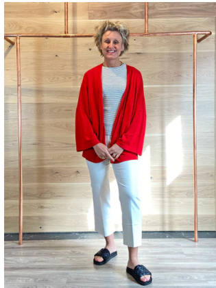
Absolut Cashmere Gaelle Cardigan Red £159.95