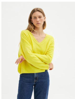
Absolut Cashmere Alicia Knit Citron £168.00