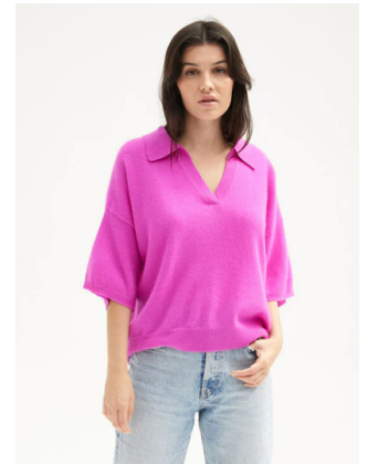
Absolut Cashmere Charlene Short Sleeve Knit Violet £182.00