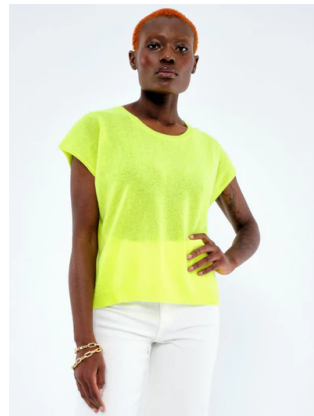
Absolut Cashmere Louise Short Sleeve Knit Neon Yellow £143.00